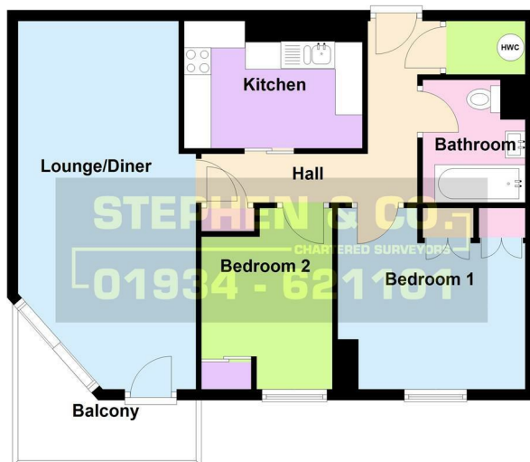
Total area: approx. 62.8 sq. metres (675.7 sq. feet)